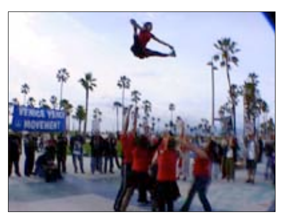
"We're teens, we're cute We're radical to boot. We're angry, we're tough, And we have had enough!" - Radical Teen Cheerleaders cheer