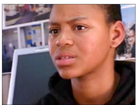
"War, that's such a short word. Short as a person's life."