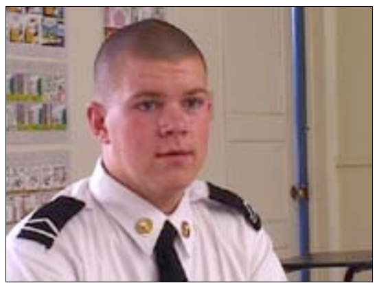
"I love this country. I'm willing to fight for it, I'm willing to kill for it, I'm willing to die for it."